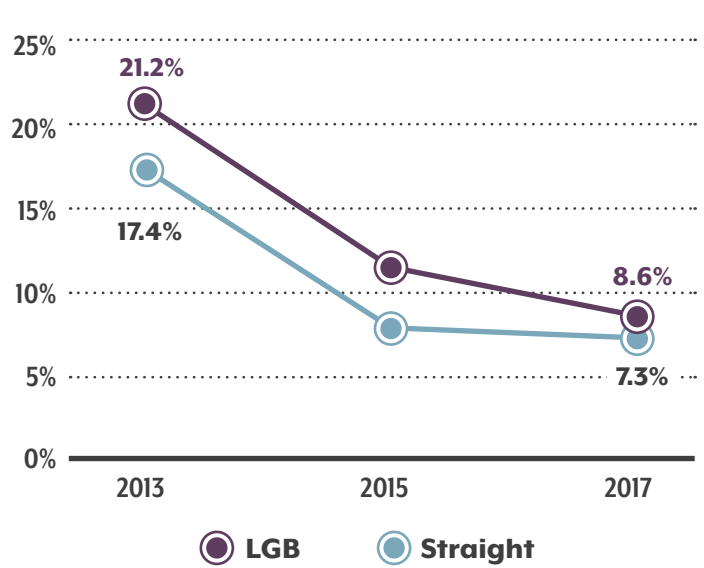
Figure 1: Insurance Coverage Greatly Improved for LGB Coloradans Since 2013